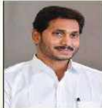
Sri Y.S. Jagan Mohan Reddy Hon'ble Chief Minister Andhra Pradesh