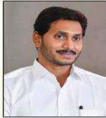
Sri Y.S. Jagan Mohan Reddy Hon'ble Chief Minister Andhra Pradesh